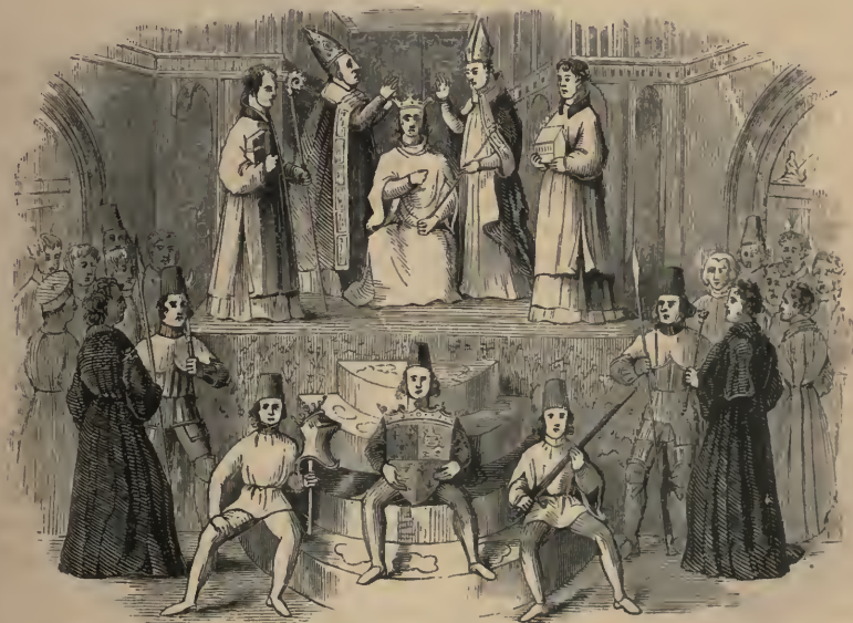
CORONATION OF HENRY IV. From MSS. of 15th century.

The procession entered the church about nine o'clock ; in the middle of which was erected a scaffold covered with crimson cloth, and in the centre a royal throne of cloth of gold. When the duke entered the church, he seated himself on the throne, and was thus in regal state, except having the crown on his head. The archbishop of Canterbury proclaimed from the four corners of the scaffold, how God had given them a man for their lord and sovereign, and then asked the people if they were consenting to his being consecrated and crowned king.